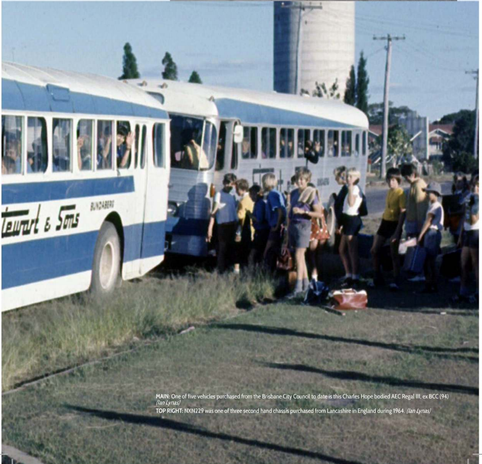
MAIN: One of five vehicles purchased from the Brisbane City Council to date is this Charles Hope bodied AEC Regal III, ex BCC (94)