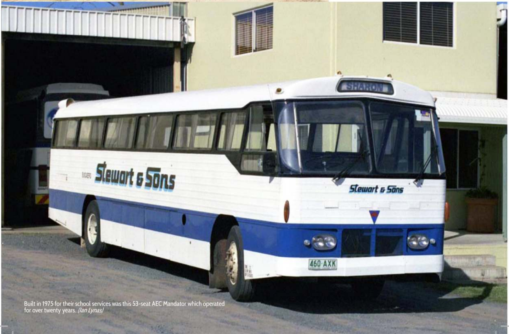
Built in 1975 for their school services was this 53-seat AEC Mandator which operated for over twenty years.