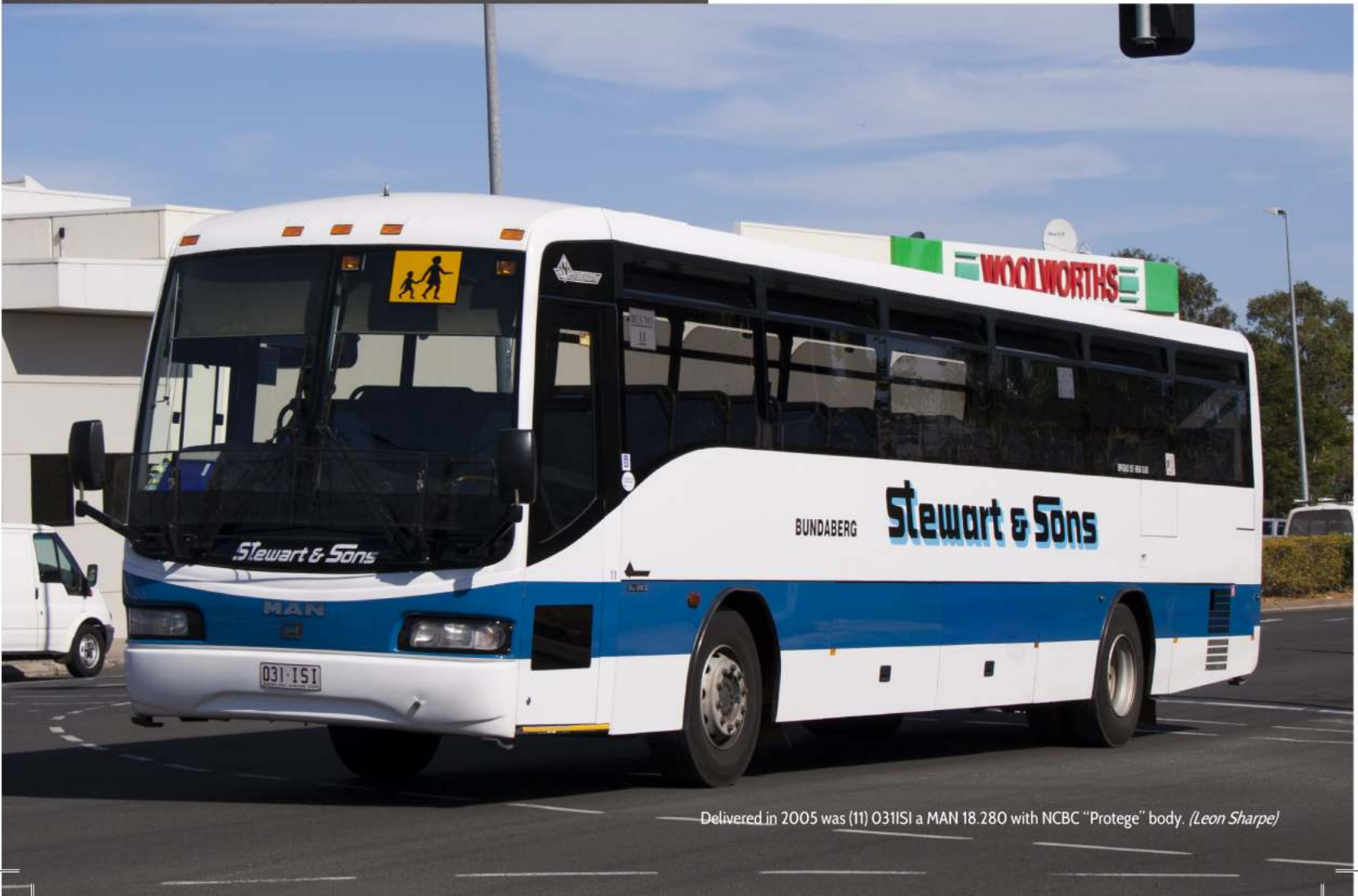
Delivered in 2005 was (11) 0311SI a MAN 18.280 with NCBC "Protege" body.