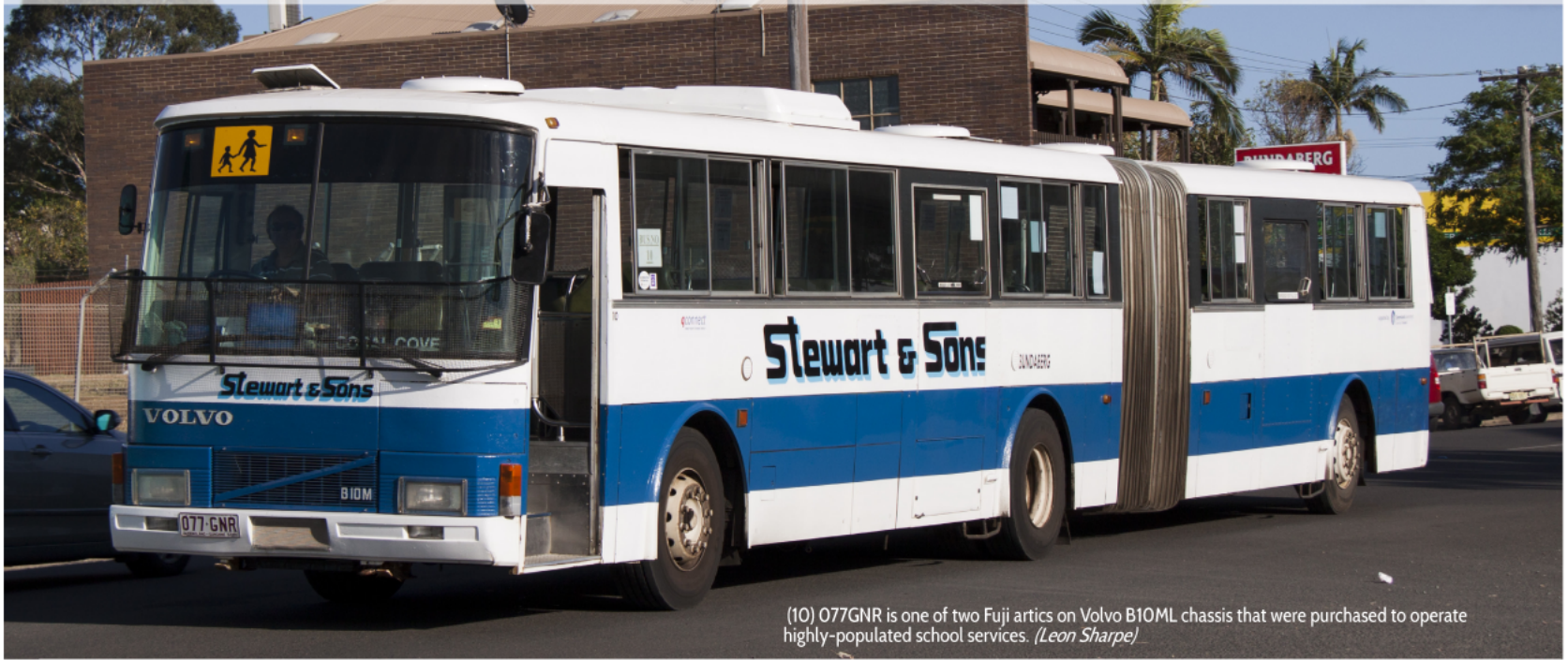
(10) 077GNR is one of two Fuji artics on Volvo B10ML chassis that were purchased to operate highly-populated school services.