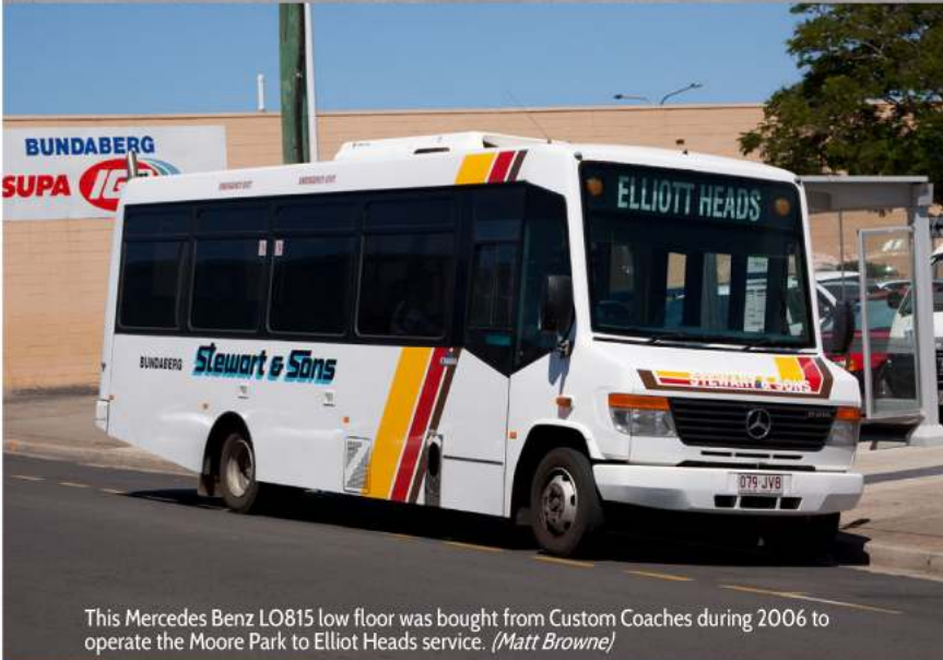
This Mercedes Benz LO815 low floor was bought from Custom Coaches during 2006 to operate the Moore Park to Elliot Heads service.

build a replica Superior body on Bedford YRT3 chassis for his Kangaroo Line business near Caboolture. As West wanted a particular body style Superior had ceased producing, Superior sent up front and rear header moulds to Bundaberg as a flawless replica was constructed during 1975.