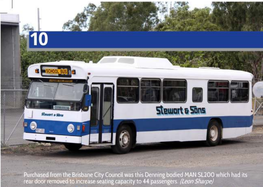
Purchased from the Brisbane City Council was this Denning bodied MAN SL200 which had its rear door removed to increase seating capacity to 44 passengers. (Leon Sharpe)