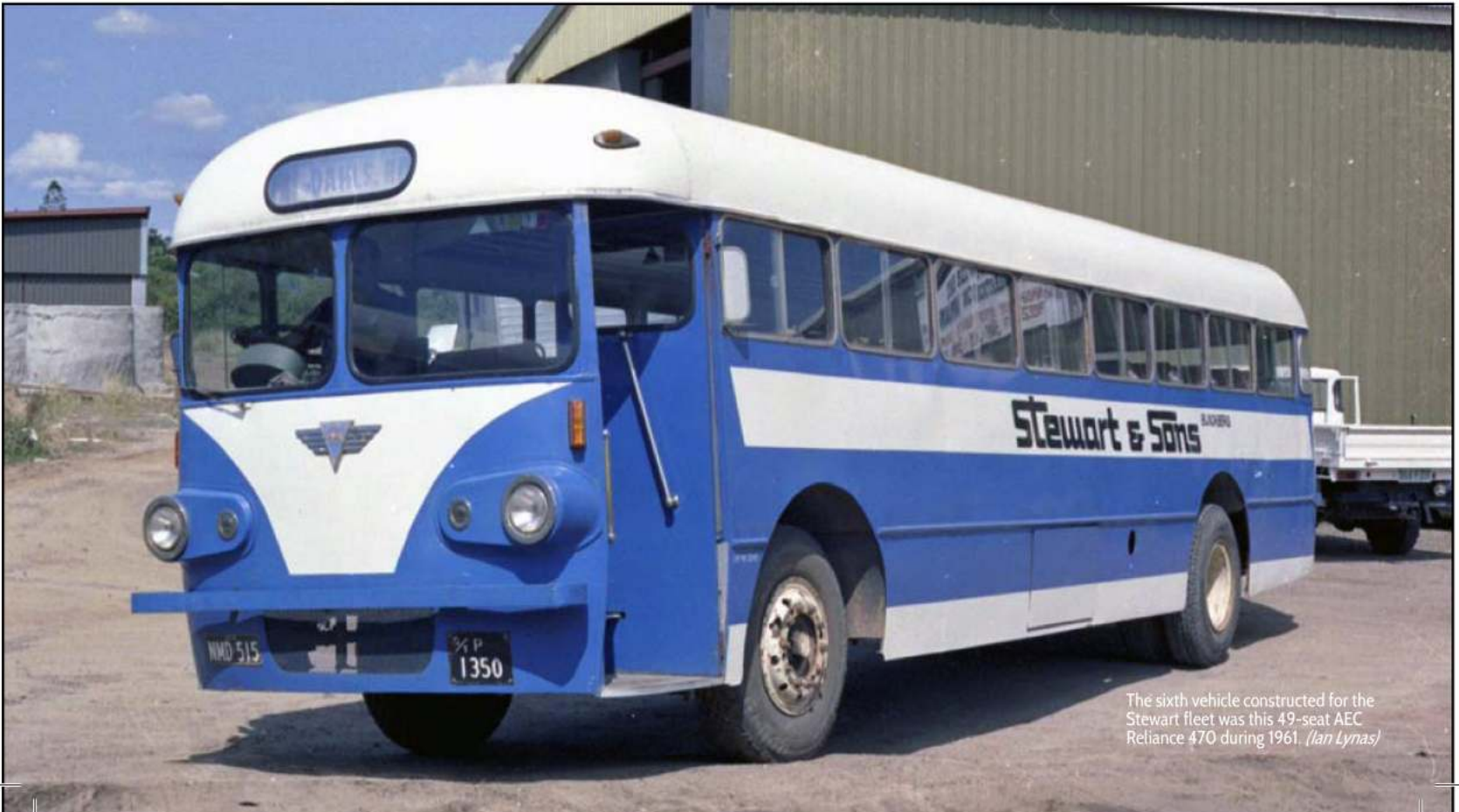
The sixth vehicle constructed for the Stewart fleet was this 49-seat AEC Reliance 470 during 1961.

with one bus operating a run each. Five vehicles ran to South Kolan for cane cutters, field workers, mill workers and shift workers - while the sixth bus operated a combined shoppers and workers service to Elliot Heads. The vehicles were regularly used after hours for services to the picture theatre and ferrying passengers to dances at night. The fleet inherited from Jorgensen typified the era and consisted of: